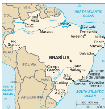
Figure 1. Port of Santos localization

The Port of Santos, the biggest in Brazil, is located in the Brazilian central coast (Fig.1), 90 km from the city of São Paulo (25° 53' South 46° 19' West), a gateway to the most heavily industrialized regions.